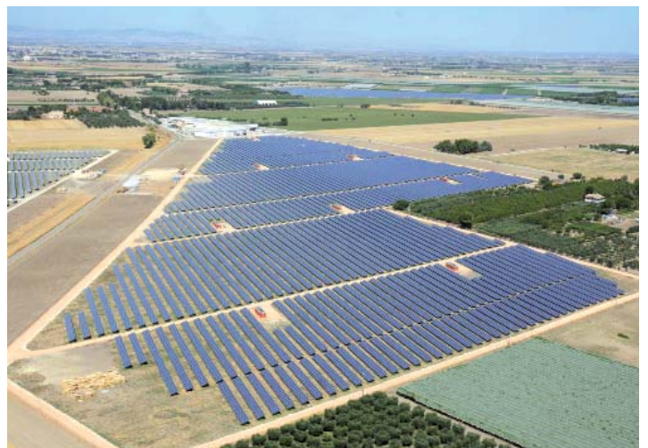
ABB is responsible for remote monitoring of the plants from its dedicated PV control center in Genoa.

ABB was contracted to execute and commission the entire project within six months. The project was successfully completed and handed over 40 days ahead of schedule (including the substation), thereby enabling the customer to win a substantial gain in production and qualify for the targeted feed-in tariff.